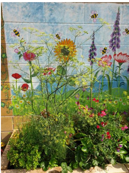
The bees enjoying the fennel

We were keen to complete our community garden this year and as Spring arrived, we built a raised bed and began planting. The women and families enjoyed sowing seeds and seeing the plants grow over the summer as they learned the language of growing.