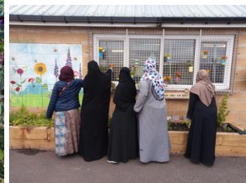
The language of flowers