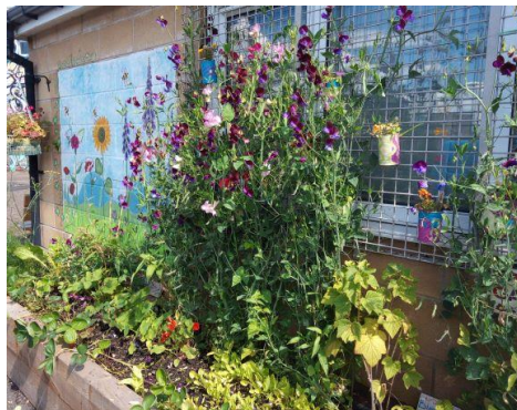
An abundance of sweet peas